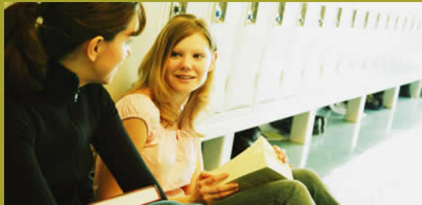
Share Your Thoughts - we'll listen

Horizons4Girls also has professional counselors available.